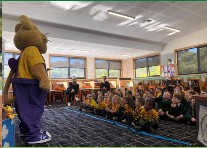
Our Kinder to Year 2 Students at the Bravehearts 'Keep Safe Adventure Show' last week! They had lots of fun with Ditto the Bear learning about safety.