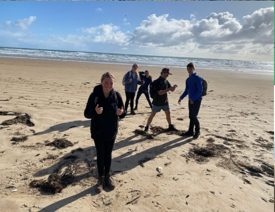
Outdoor Leadership & Education students on their hike from Badgers Head to Bakers Beach last Friday.