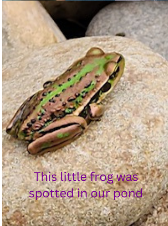
This little frog was spotted in our pond