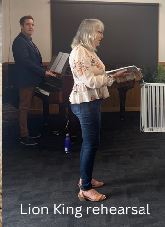
Lion King rehearsal