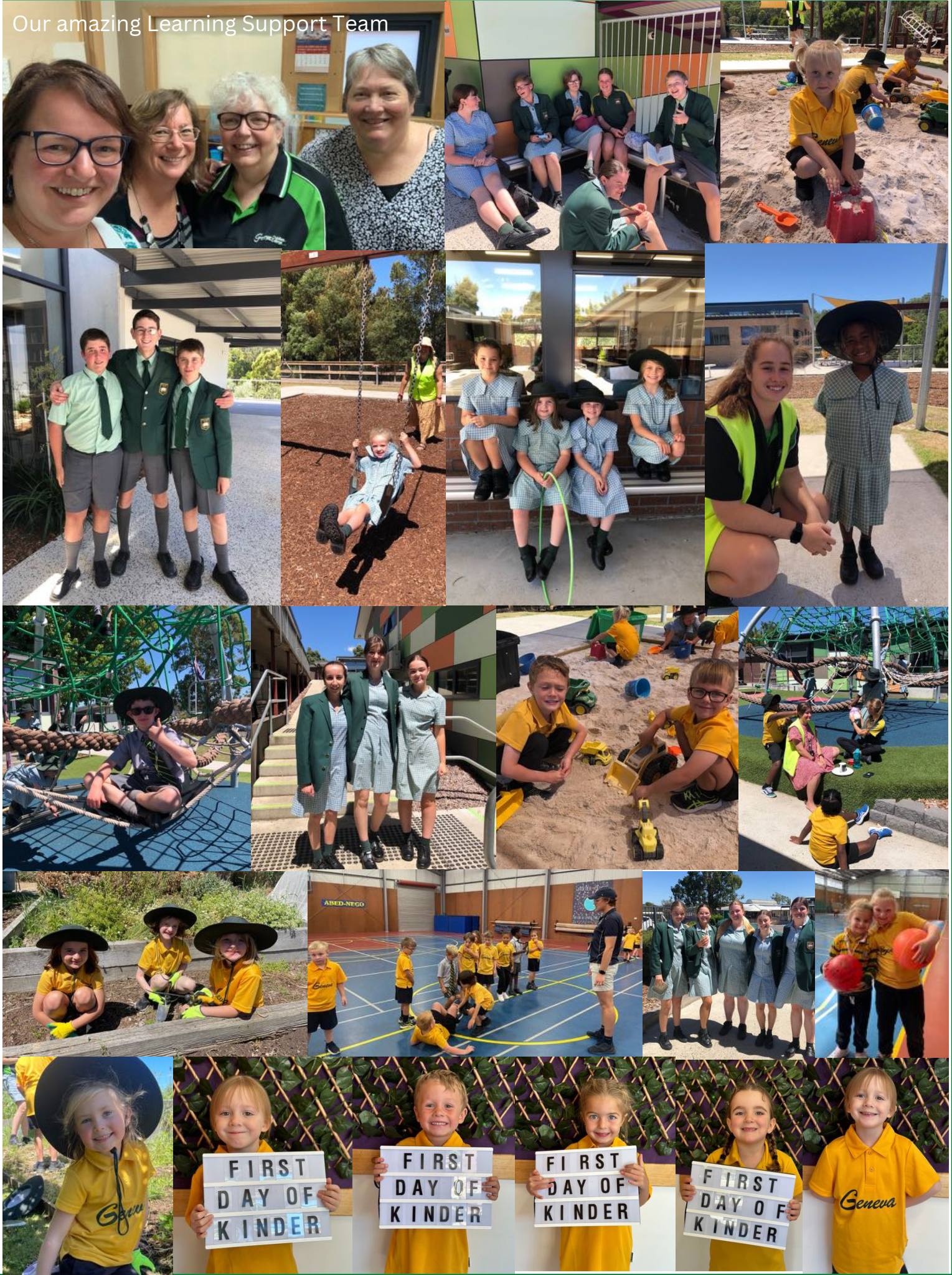
Our amazing Learning Support Team