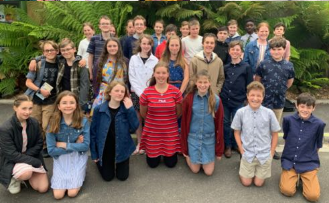
Our Year 6's heading off for their celebration afternoon tea!