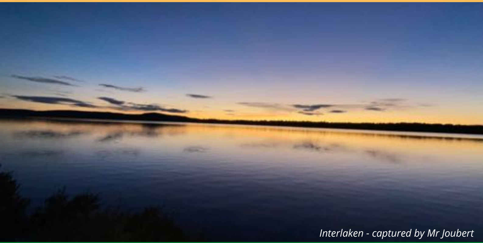
Interlaken