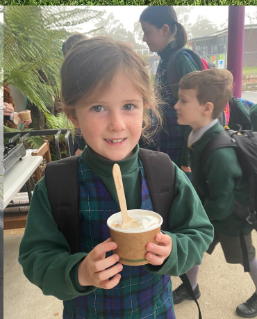
Monday morning hot porridge for the students. Yummy!