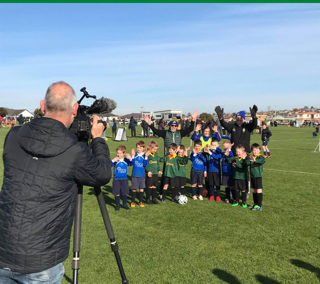
Soccer on Saturday morning!