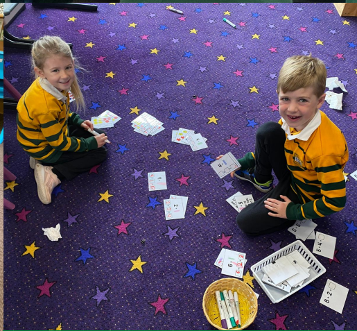
Big smiles from our Preps this week.