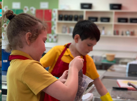
Year 2 having fun during cooking!