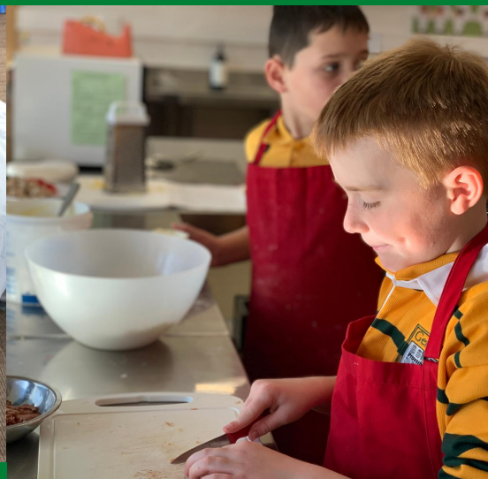
Years 5 & 6 enjoying Free Choice Friday in the afternoon.