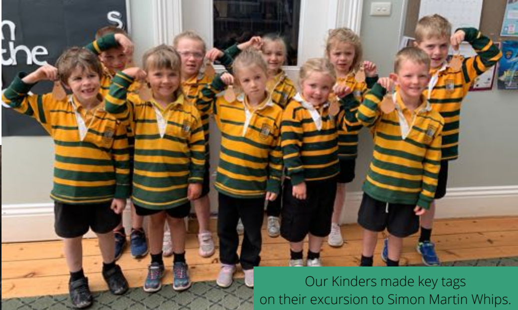
Our Kinders made key tags on their excursion to Simon Martin Whips.