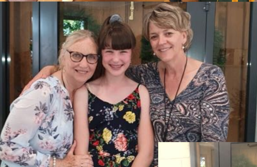
Year 6 enjoying afternoon tea at the Workshop Cafe.