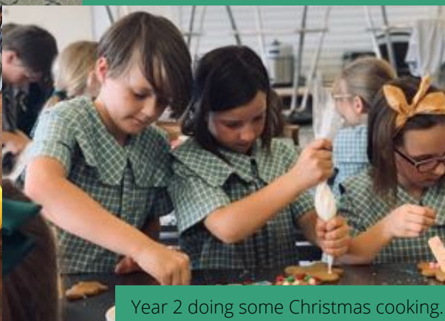
Year 2 doing some Christmas cooking.