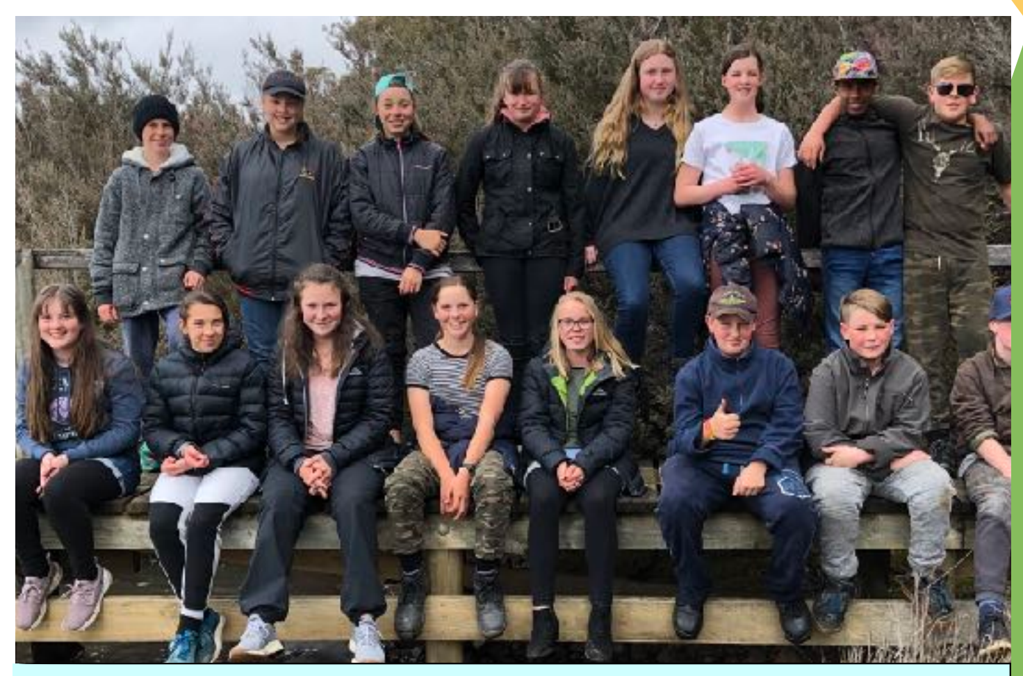
Year 7 Camp - last week at Interlaken.

Words are critical; they can heal or wound; they can build up or tear down. Saying wrong words can be destructive. Things like "I'm right and you're wrong" We need to remember we are all sinners and so should be quick to listen to others and slow to speak or answer back. Being sarcastic is another way we use destructive words toward others. If we feel the need to speak the truth to someone it should be done in such a way to build them up, not tear them down. Unkind and unloving words are like darts that pierce the other person's heart. But words of kindness, graciousness and love will help build others up and the blessing will flow on to you. The Bible tells us the a word spoken at just the right time, in just the right way, is like a beautiful picture surrounded with a frame of gold! Who have you blessed today with your words?